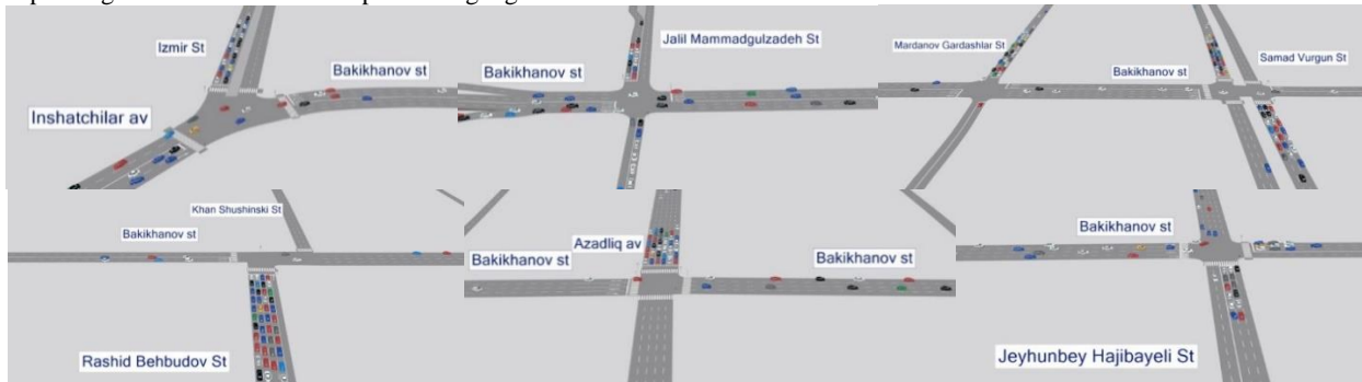
Figure 1. Example of 3D tests of the simulation model of traffic flow at intersections of Bakikhanov Street

intensity of the traffic flow. The total delay time of all vehicles on main and intersecting streets on a street with a coordinated arrangement can be determined using traditional analytical methods. However, it is more appropriate to obtain results that are more consistent with real conditions using a simulation model based on data taken from a real street and road network. The experience of using the PTV VISSIM modeling program for studying, modeling and testing traffic flows is widespread [10,11,12,13]. Figure 1 shows a test image of the simulation model of coordinated traffic control on Bakikhanov Street, one of the main streets of Baku, created using the PTV VISSIM program. Traffic light rules have been introduced at 7 intersections of the street.